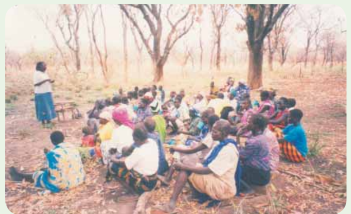
Women participating in small arms control workshop in Nimule, Magwi County

After the signing of the Comprehensive Peace Agreement there was the need to start an action network on small arms in the semi autonomous South Sudan. This was necessitated by the fact that arms concerns in the South are radically different from those in the North. The twenty one years of war in South Sudan resulted in a scenario completely different from that in the north. The patterns and trends on availability, movement and use of arms in South Sudan were completely altered by the war. All these factors necessitated the formation of an action network in the South. The need to establish a network to strengthen civil society action on addressing small arms in Southern Sudan and to represent South Sudanese Civil Society in regional and international small arms processes necessitated the formation of SSANSA. The founders of SSANSA keenly considered the fact that South Sudan and Northern Sudan have different socio-cultural, socio-orientation and socio-political worldviews—and that the two semi-autonomous locations are geographically at quite a distance from each other. These differences and factors make it practically impossible for Sudan Action Network on Small Arms to address arms concerns in South Sudan.