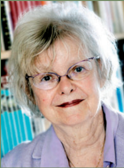
INGE GENEKKE / INTERNATIONAL REHABILITATION COUNCIL FOR TORTURE VICTIMS (IRCT), LAUREATE 1988

In 1982, the Rehabilitation and Research Centre for Torture Victims (RCT) was founded in Copenhagen, with Inge Genefke as Medical Director.